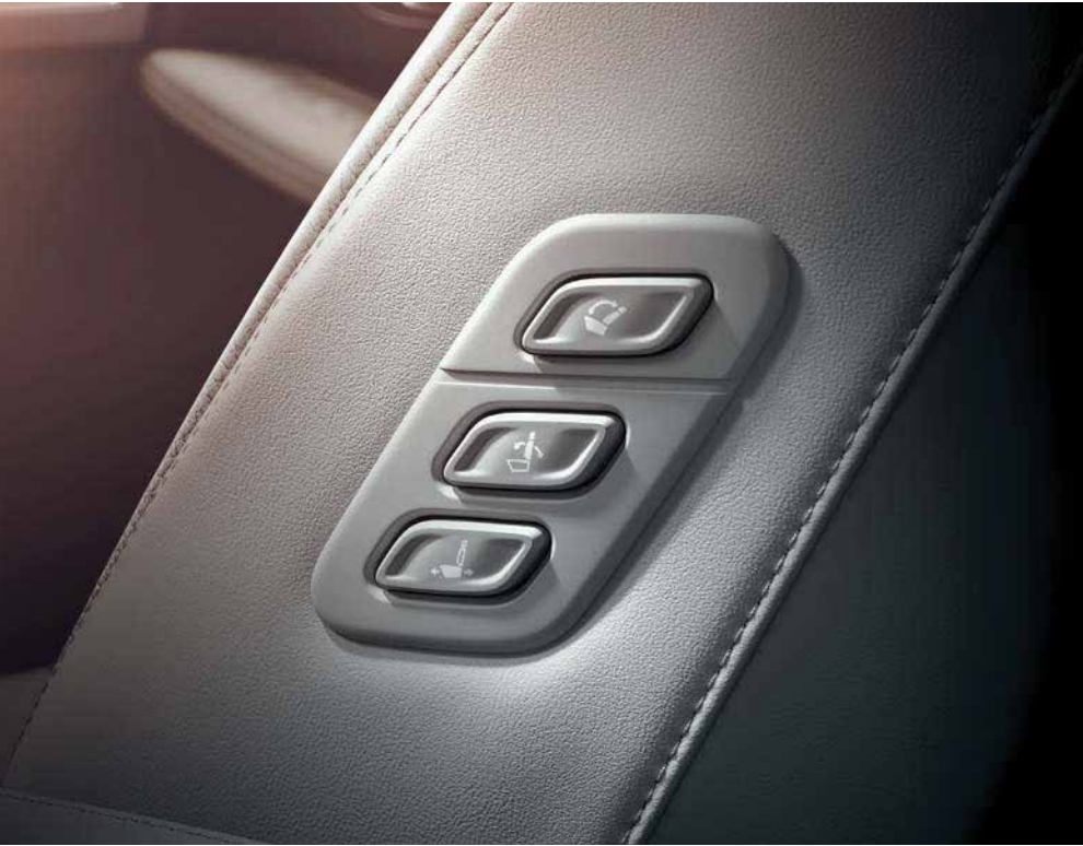
Walk-In device The walk-in device button extends front seat control functions to the rear seat passenger such as chauffeured executives who may want extra legroom. It's one of many interior details that demonstrate careful consideration for comfort and convenience.