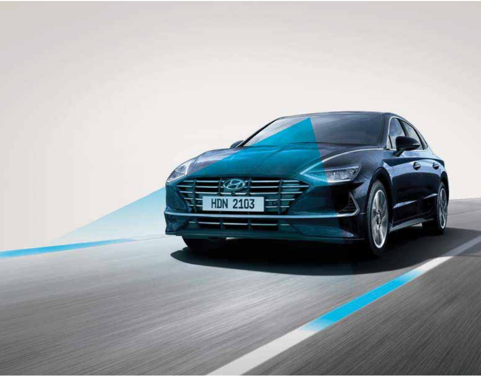
Lane Following Assist (LFA)

A road mishap may not be on your radar but Hyundai SmartSense is always ready for the worst. SmartSense encompasses Hyundai's cutting-edge Advanced Driver Safety Assistance Systems. ADAS has your back, protecting you with features like Lane Following Assist and Safe Exit Assist that are continuously on the lookout, working quietly behind the scenes scanning the road for signs of trouble. You may not be aware of that car in the blind spot, but Sonata's Blind Spot Collision Avoidance Assist is perfectly aware and will alert you to its presence. Sonata ADAS technology loves you and protects you like family.