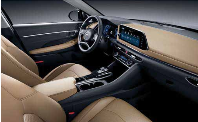
Camel two-tone interior