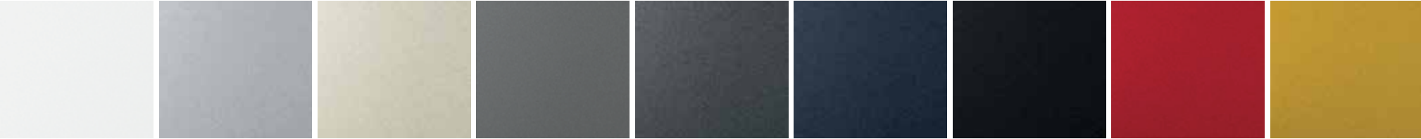
WC9 White cream R2T Shimmering silver Y2S Glowing silver NT2 Hampton gray T2G Nocturne gray XB2 Oxford blue NB9 Midnight black Y2E_3-coat Flame red W2B Glowing yellow