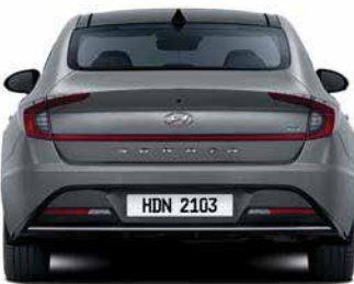
Wheel tread* 1,625

Unit : mm * Wheel tread • 16" Steel wheel (Front / Rear) : 1,633 / 1,640 • 16" Alloy wheel (Front / Rear) : 1,633 / 1,640 • 17" Alloy wheel (Front / Rear) : 1,623 / 1,630