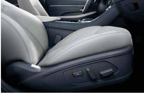
Premium relaxation seat (passenger)