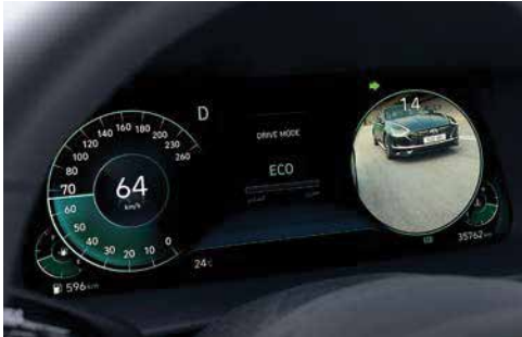
Blind spot view monitor