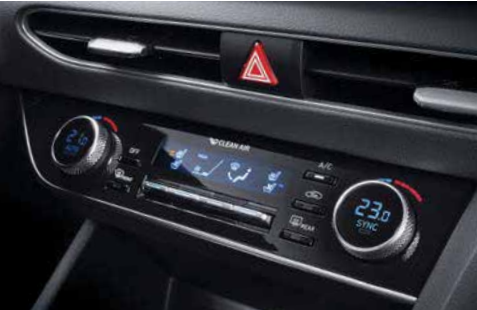
Full auto air conditioning system