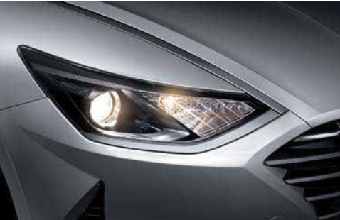
Projection headlamps / Daytime running light (Bulb)