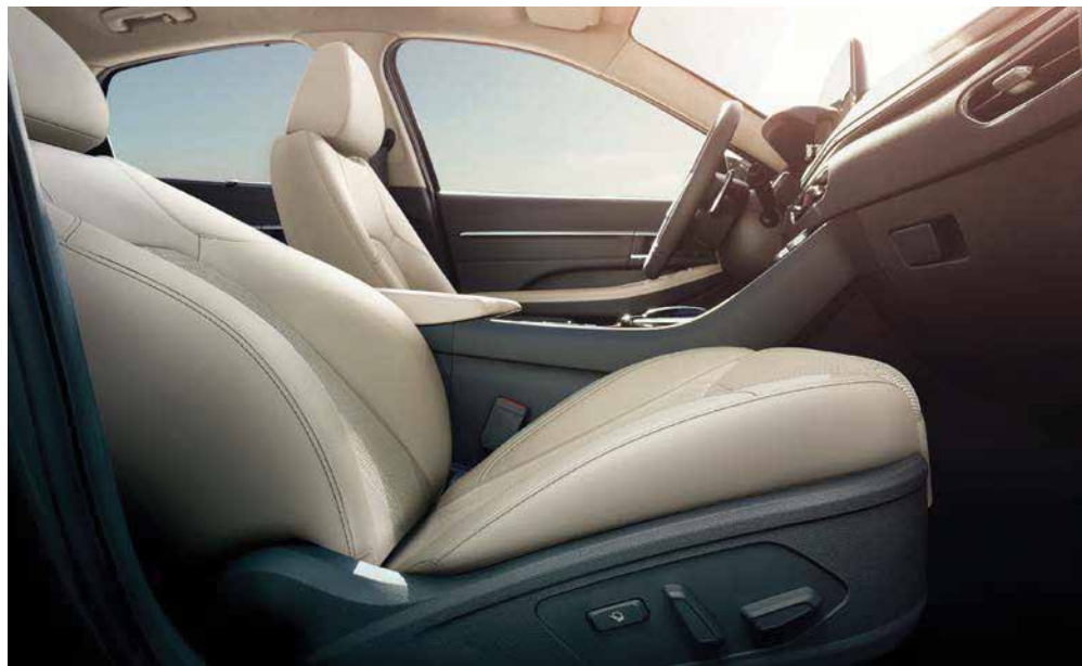
Premium relaxation seat (passenger)

Sonata takes equally good care of its passengers with seats that bolster and support the spine's natural S-curve so you can really feel the difference that good design makes. The relaxation comfort seat allows the front passenger to unwind by replicating the spinal support of a reclining chaise lounge to achieve a feeling of near weightlessness. This optional GLS features lowers the backrest while readjusting the tilt of the seat cushion at the press of a single button.