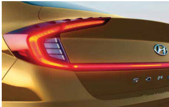
18" Alloy wheels (Opt) LED rear combination lamps