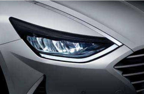
LED headlamps (MFR type) / Daytime running light (LED)