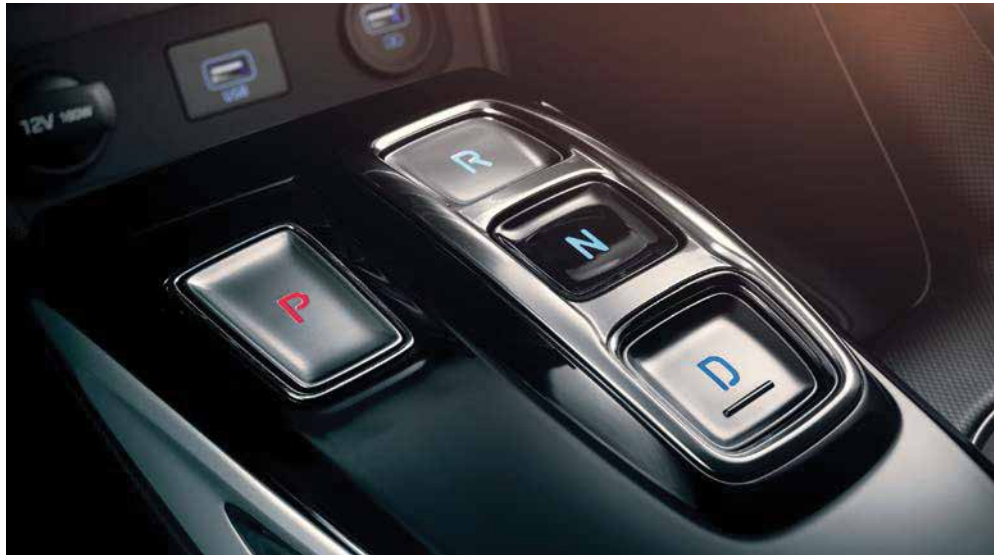
Shift-by-wire automatic transmission