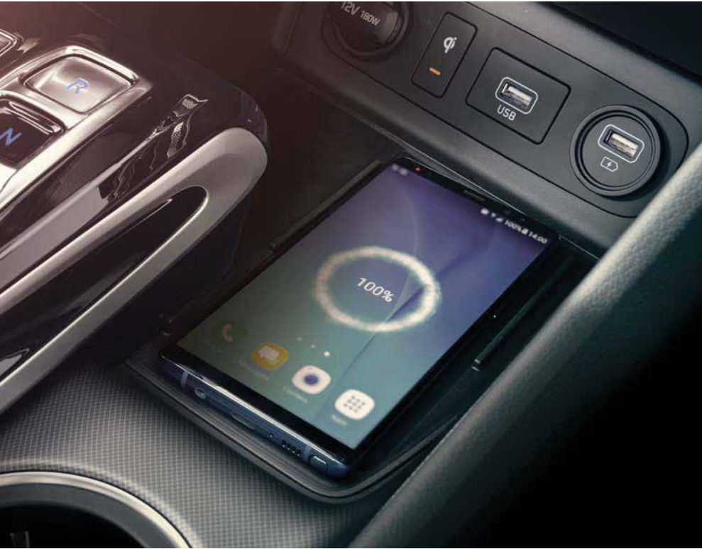
Wireless smartphone charging system Lost or misplaced recharging cords? The cord is a thing of the past with the wireless smartphone charging system that ensures your phone will never go dead. The vehicle will even chime a gentle warning should the phone be accidentally left behind after exiting the vehicle.