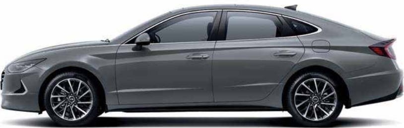
Wheel base 2,840 Overall length 4,900