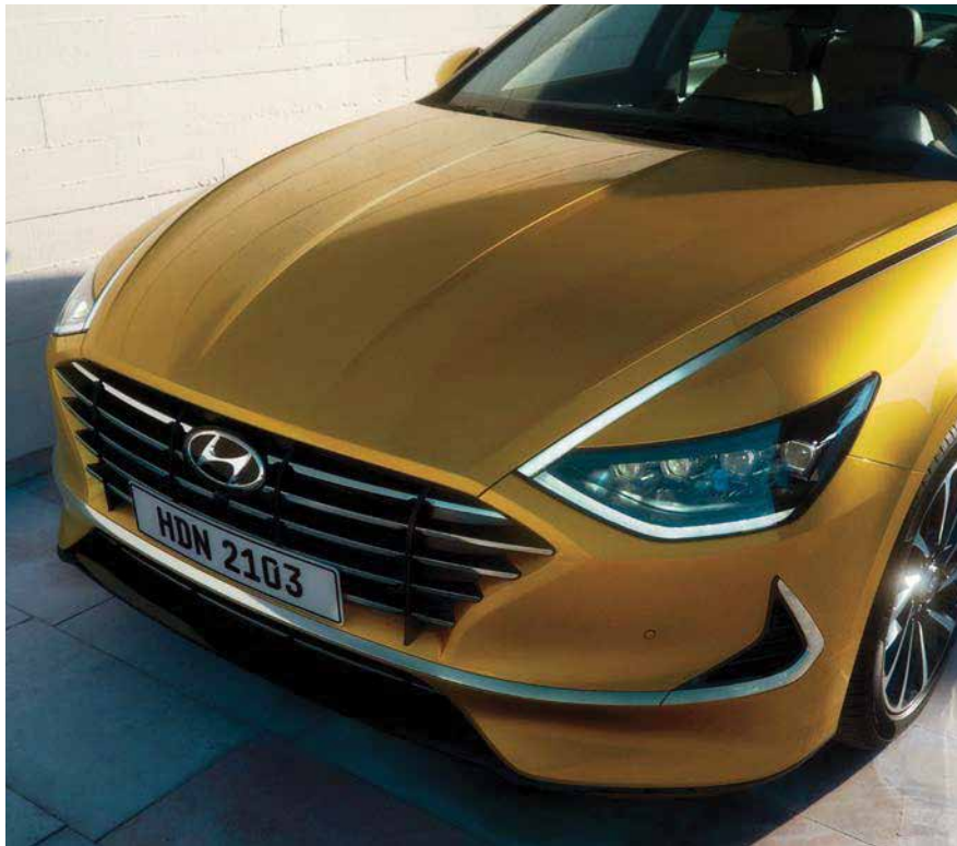
Radiator grille / LED daytime running lights (DRL) / LED Headlamps

Sonata's high style does more than just spark the emotions. It delivers high rewards with innovative design features like the gradient hidden light technology, a sure conversation starter that adds to Sonata's mystique. Sonata's high-tech image is reinforced with LED rear combination lamps and available full-LED front lighting. For a statement that expresses high performance, Hyundai offers the optional 18-in alloy wheel package and premium Pirelli tires.