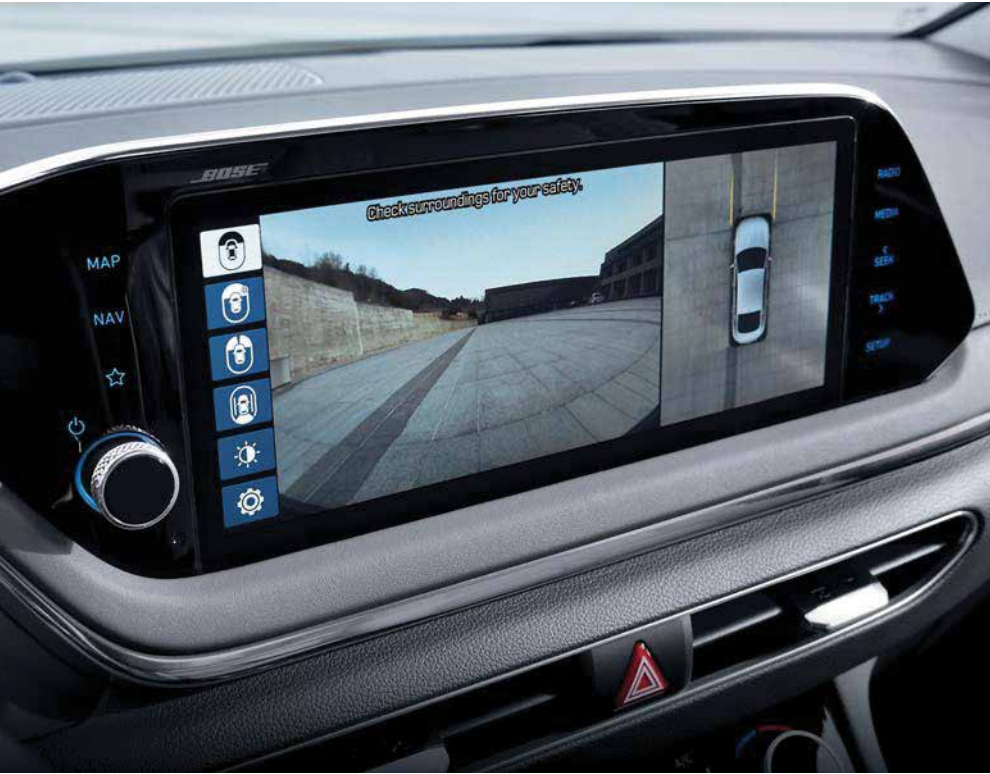
Surround View Monitor (SVM)

Radar sensors in the rear bumper are used to warn the driver of approaching vehicles in the blind spot area and will activate the Electronic Stability Control system and apply the brakes when there is a collision risk during lane change maneuvers. Active at speeds of over 40km/h and on roads with painted lane markings on both sides.