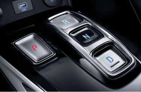
Shift-by-wire automatic transmission