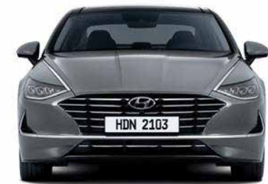
Overall width 1,860 Wheel tread* 1,618