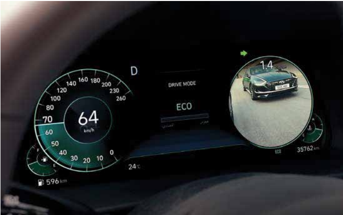
Blind spot view monitor

Sonata flexes its muscle on command to keep you feeling confident and in charge in all driving situations. Whether cruising along the open highway or working through stop and go city traffic, there's a nimble yet dynamic quality that calms, relaxes and satisfies the driver. Steering is light yet precise and the ride is silky-smooth. Premium appointments such as the head-up display and SuperVision gauge cluster with its blind spot view monitor further elevate driver awareness and safety.