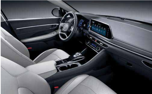
Greige two-tone interior