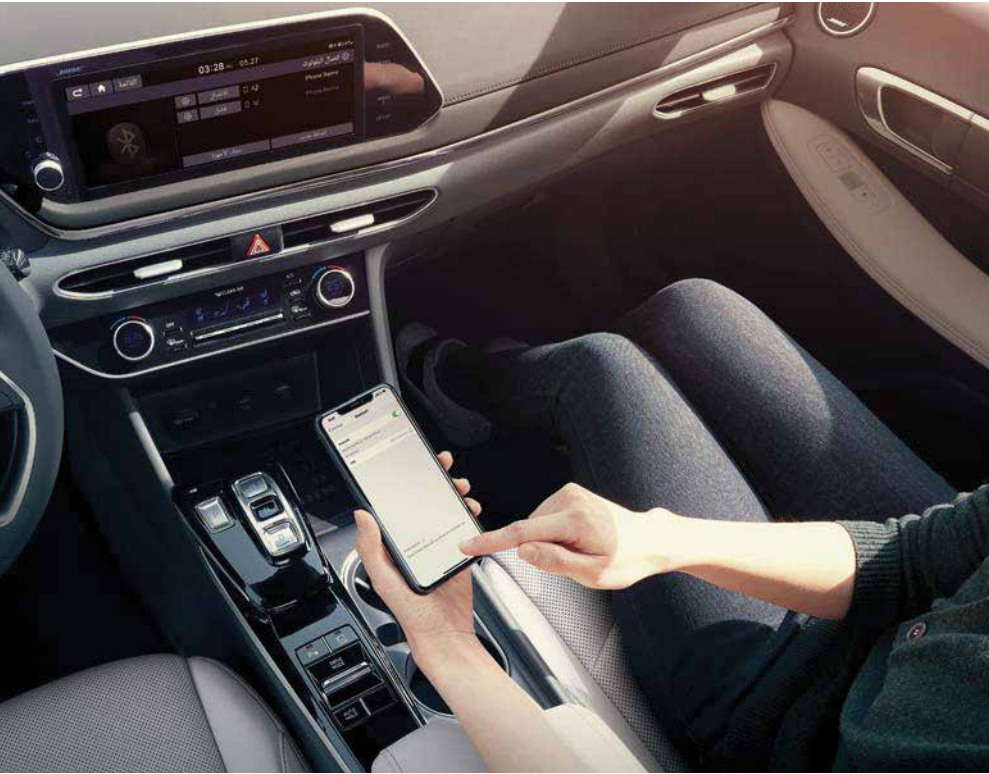
Bluetooth multi-pairing Sonata takes the next step in Bluetooth pairing by supporting dual devices. Now the driver can enjoy the use of the hands-free function, including optional voice recognition support while the second device is connected to the Sonata for streaming or mp3 file playback.