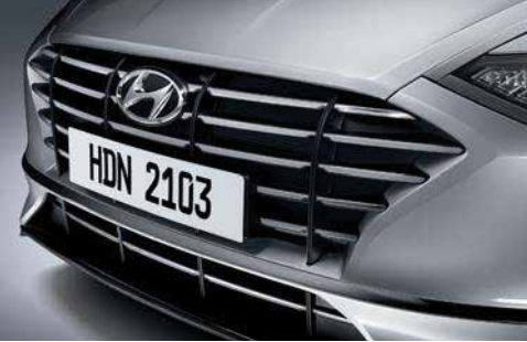
Black & Chrome coating radiator grille