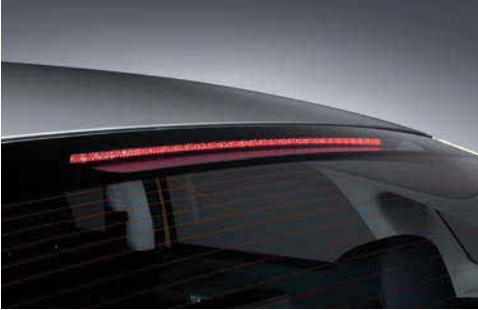
LED high mount stop lamp