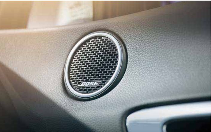
BOSE premium sound system

Sonata's premium BOSE audio system creates an immersive sound experience of such startling realism and clarity that you'll feel like you're actually there at the original source. This upgrade comes with twelve acoustically-tuned speakers, Centerpoint Surround Sound and dynamic speed compensation that will have you feeling like you have been transported into the recording studio. Bluetooth, now installed as a standard feature, further elevates the listening experience by providing the convenience of a hands-free connection to your smartphone.