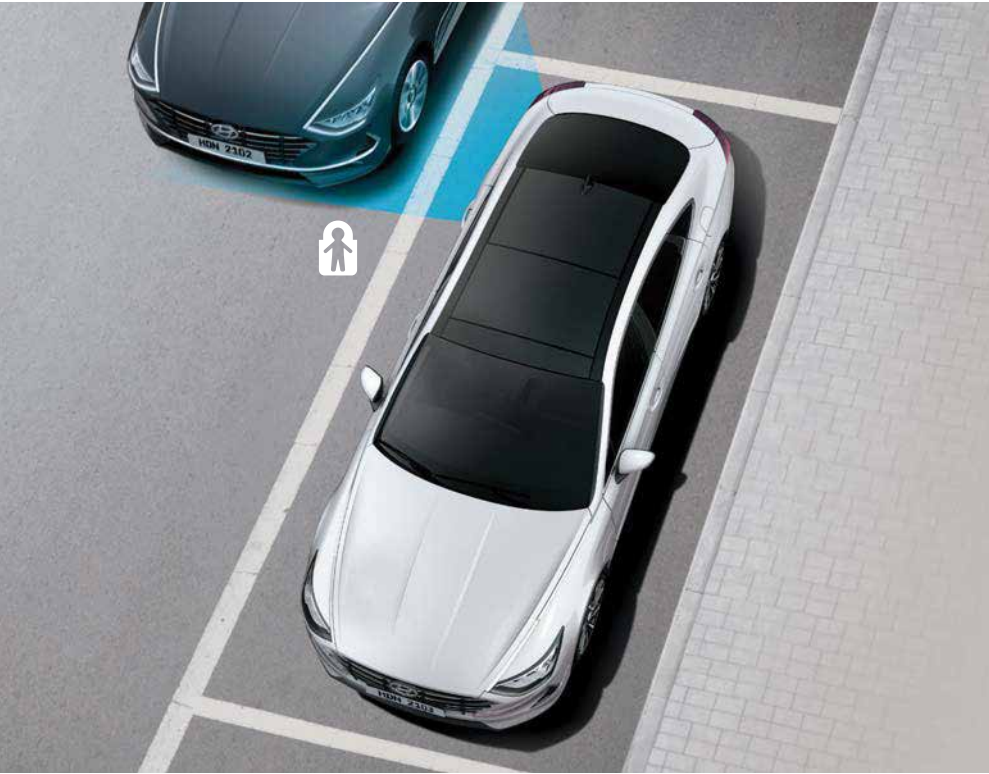
Safe Exit Assist (SEA)

The SONATA uses an omnidirectional camera to detect the location of the road lane and ensure that the vehicle is driven in its center. When necessary, automatic steering wheel control is activated to prevent the car from drifting outside the lane.