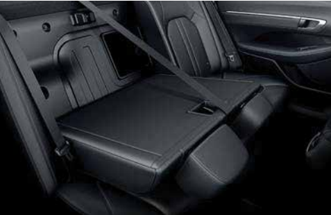
Seat folding system (6:4 type)