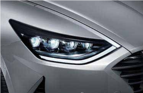
LED headlamps (Projection type) / Daytime running light (LED)