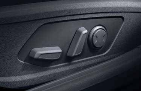
Driver's 10-way power seat