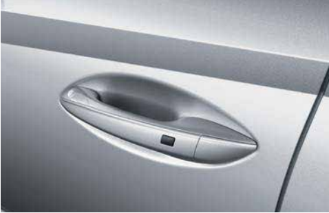
Outside door handle