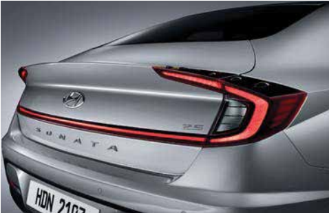
LED rear combination lamps (Bulb turn signal_16" & 17" wheel / LED turn signal_18" wheel)