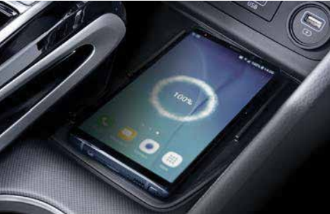
Wireless smartphone charging system