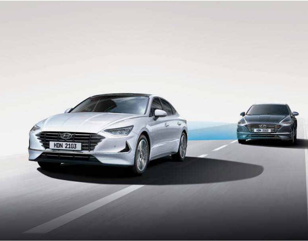
Blind-spot Collision-avoidance Assist (BCA)

SEA blocks any attempt to disengage the child safety lock and prevents the rear door from opening when it is unsafe to do so. On detecting the presence of a rear seat passenger and the approach of a vehicle from the rear, SEA will also flash a pop-up message on the cluster and will issue an audible alarm, alerting the driver to the danger.