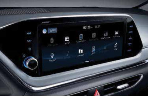
10.25" LCD touch screen