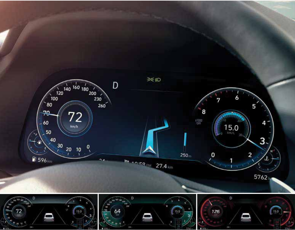
12.3 inch full LCD cluster / Integrated driving mode (Comfort / Smart / Eco / Sport) The SuperVision cluster seamlessly integrates with the navigation unit to offer turn-by-turn navigation and an expanded array of information presented in clear, concise and colorful graphics. By automatic adjustment of the transmission shift schedule, the integrated driving mode offers the driver a choice of four types of drive settings to suit personal preferences each displayed in its own distinctive color.

Step inside and discover an interior that engages and satisfies all the senses. The cabin is a visual feast projecting elegance, warmth and delivering a rich tactile experience. The dials of the Supervision cluster come to life with stunning clarity and show impressive depth: Numbers and batons are crisp and clean with the gauges scoring big points for their elegance and functional simplicity. And just as customers would expect, the AVN touchscreen replicates the user experience of a smartphone ensuring Sonata is perfectly in step with the digital times.